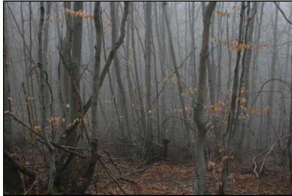
Figure 1. Coppice beech forests , which is located on the site of Musići in the area Hadzici (Sarajevo)