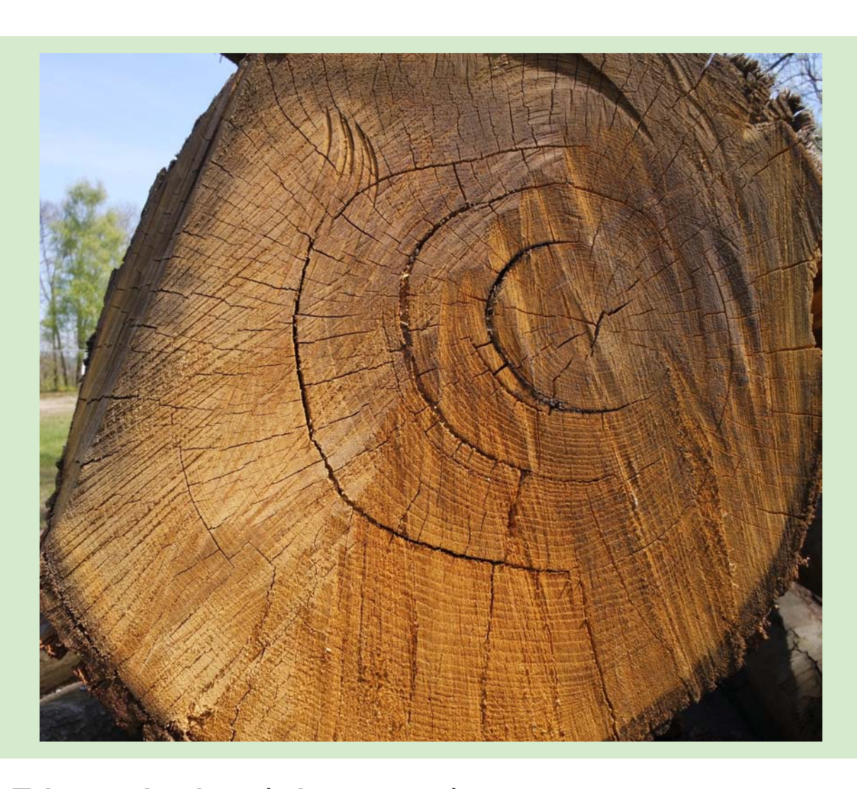
Ring shake (chestnut)