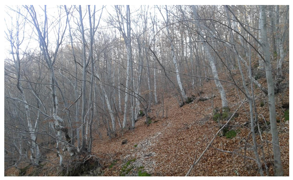
beach coppice in Bulgaria on a typical steep slope

Examination of mean increment shows that the optimal rotation time for Bulgarian coppices should be about 20 years if the production of biomass is the aim. At that age the stands do not produce seed and should regenerate by re-sprouting. However, resuming the coppicing in Bulgaria will be a silvicultural challenge because of the aging of the coppices and the oak regeneration problems. Recently, private forest owners often clear-cut their coppices but the aged coppices re-sprout poorly. The sustained management of such forests requires making use of the available natural seedlings to renew the root system. Most suitable is the femel-cut with a regeneration period from 15 to 20 years. Where the natural regeneration with seedlings is impossible or has failed, acorns have to be sown, in the autumn and after a soil preparation aiming to reduce the competing vegetation.