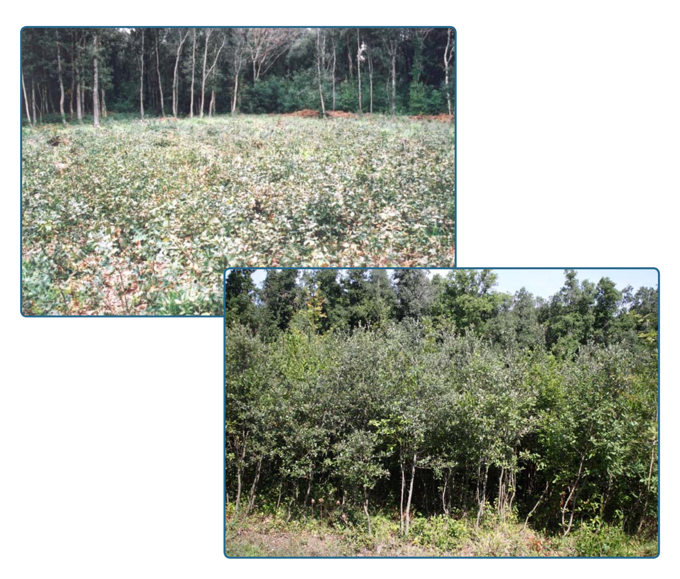
Figure 14. Successive stages of conversion by using the uniform shelterwood system; holm oak stand in Croatia