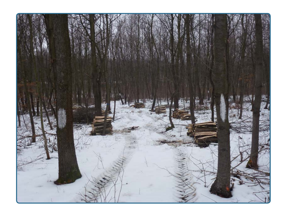
Figure 15. Indirect conversion of a mixed broadleaved simple coppice to coppice with standards in Austria

This method can also be applied to coppice with standards (Figure 15). In this case, when cutting the coppice storey of 20-30 years, a high number of standards (500-600 trees per ha or even more) are kept standing, while extracting the old standards of 3r and 4r ages if necessary. The conversion cutting begins 30 years after the selection of standards, when such trees are already 60 years of age ( 2r ) and can produce seeds needed for natural regeneration of the old coppice with standard stand.