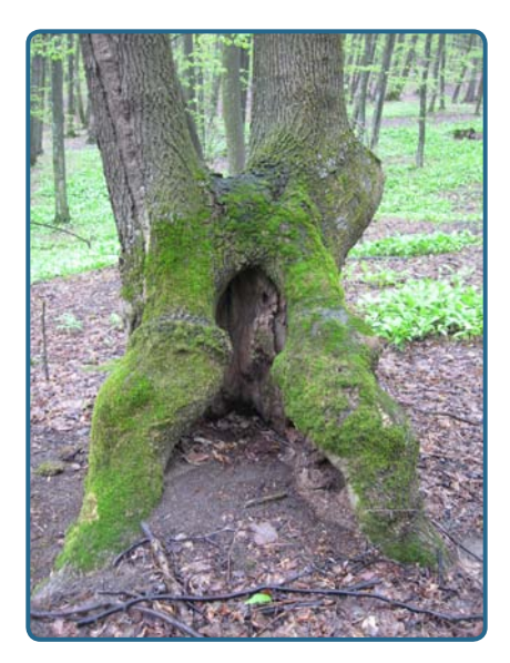
Figure 8. Old sessile oak trees treated as coppice with a high density of cavities and decaying wood: less productive than vigorous young stools but with high conservation value

Traditionally, some species were pollarded for both wood and fodder production,