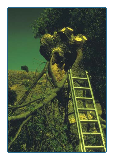
Figure 10. Pollarding a narrow-leaved ash tree

On the pollard tops, shoots are trimmed off periodically so that after this series of cuttings, the upper part of trunk looks like a reversed stump, sometimes called a 'chair' (Figure 10).