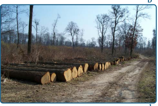
Figure 5. Timber forest products from sweet chestnut (a - Great Britain; b - Italy), black locust (c - France) and oak (d - Austria) coppices