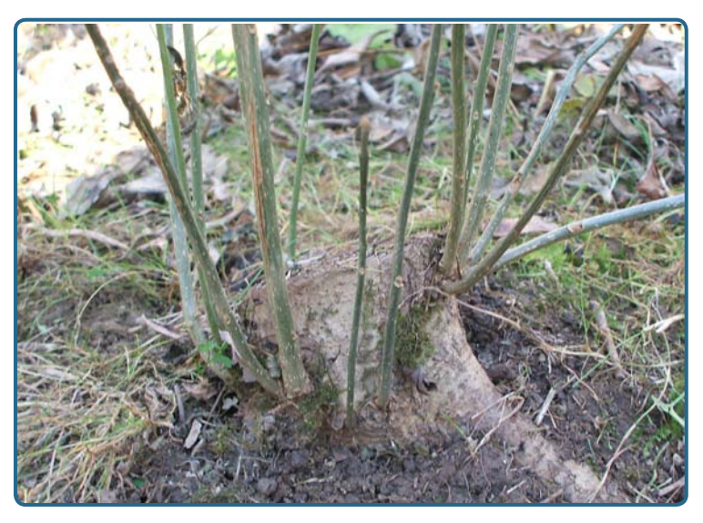
Figure 3. Stump and stool shoots on hornbeam (a), sweet chestnut (b), eucalypt (c), sessile oak (d), and common ash (e) (photos V.N. Nicolescu and V. Bruckman).