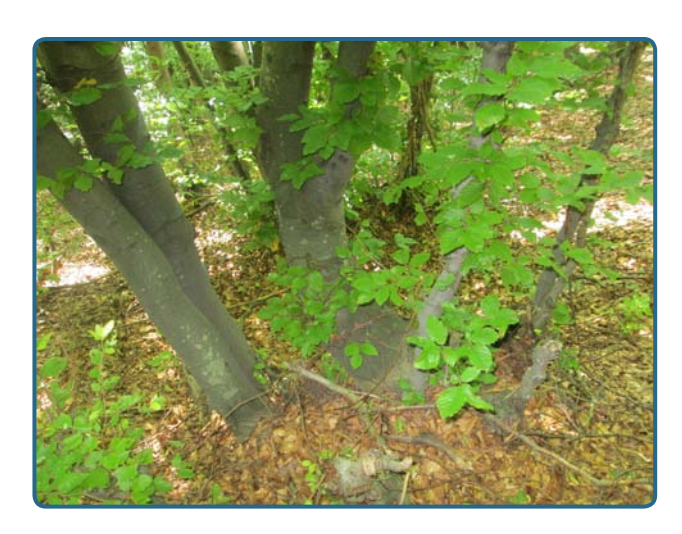
Figure 11. Coppice selection with European beech in Bosnia and Herzegovina