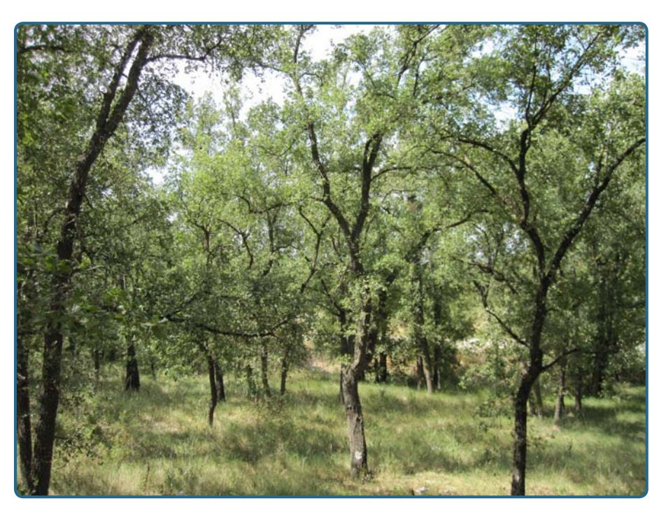
Figure 16. Neglected simple coppice stand of Quercus faginea in Spain

Another need for restoration arises in abandoned coppices with standards, which possess unbalanced CWS structure due to the prolongation of the underwood's rotation age. The prescription of restoration activities depends on (i) the number of adequate, quality overwood trees per hectare, as well as (ii) the regeneration ability of former underwood trees. If there are enough high quality trees in the overwood (20-40 individuals/ha), the cut of the coppice should be combined with a selective cut in the overstory in order to provide enough light for resprouting. The harvesting of standards should be done carefully in order to minimise damage to the coppice stools. In the case of a lack of natural regeneration by seed, the high stump sprouting ability and valuable tree species for the planting or sowing of overwood should be utilised.