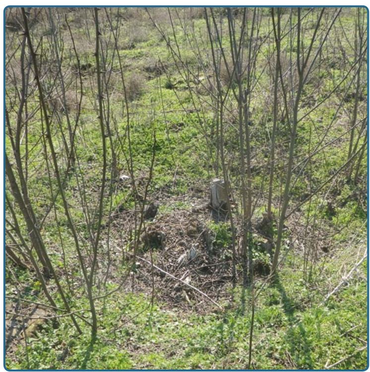
Figure 4. Root suckers of silver linden (a - photo V.N. Nicolescu) and black locust (b – photo C. Hernea)

are more intimately attached to the stump and so less prone to be separated from it. Consequently, the stump shoots are more desirable and should be favoured after cutting.