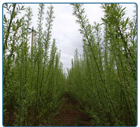
Figure 6. Short rotation coppice

Traditionally, coppice forests were managed to provide wood material, with the main product having been firewood. Further common products were charcoal, basketry, sticks, fencing, mining timber, poles, pulpwood, and small-sized timber.