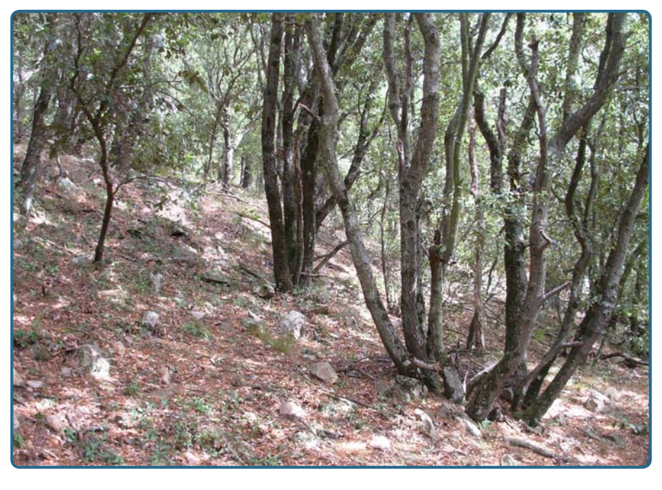
Figure 7. Holm oak simple coppice in Spain

local site conditions. Rotations are usually between 5 (willow osier) and 40 years (oak, hornbeam, beech), but can reach up to 60 years (alder). New shoots in this type of forest grow very fast at the beginning, as a result of their developed root system. Thus, the height and diameter increment culminates 20-30 years earlier than in forest originating from seeds, in accordance with local