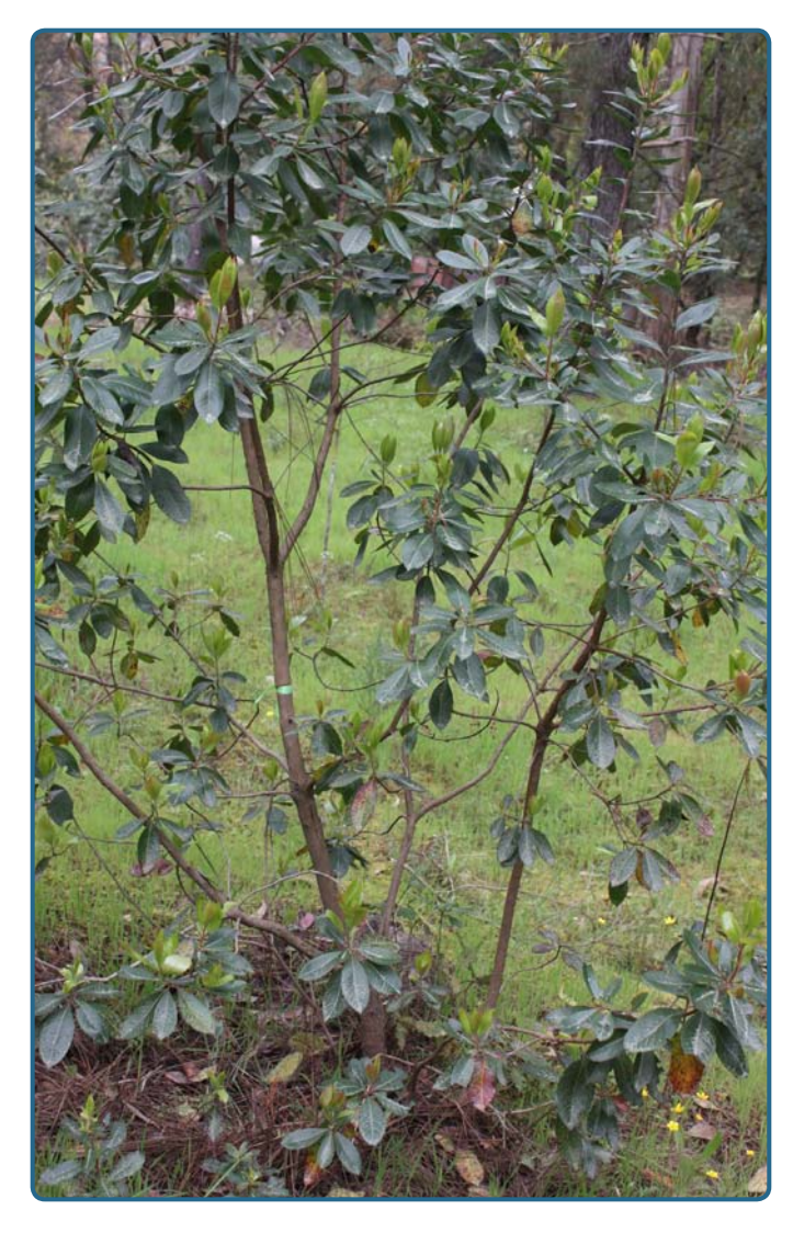
Figure 2. Natural sprouting in strawberry tree