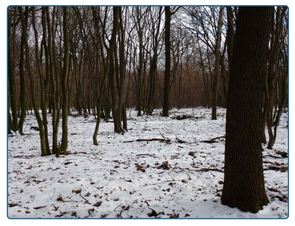
Figure 12. Coppice with standards stand in Austria

if not possible, from young and vigorous shoots, already individualized from the stool, or from root suckers. The trees reserved as standards originate from valuable light-demanding and species, with tall, large, balanced and open crowns, wind-firm and scattered as regularly as possible [4] [8] [19] [40].