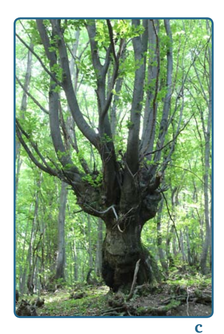
Figure 9. Repeatedly pollarded white willow (a), pedunculate oak (b) and European beech (c)

while beech and oak pollards were used to produce small-sized wood. Pollarded trees often show low trunk quality (hollow trunks and rot holes due to the regular cutting) and lower diameter growth. With the shift in demand from small-sized wood and fodder to larger industrial wood (trunks), the practice of pollarding was gradually abandoned, especially with beech and oak. Many of the pollarded oak trees that may be found in the landscape (e.g. in Britain, Turkey, Sweden) indeed have hollow trunks as a result of this kind of cutting. In certain regions (e.g., Portugal), pollarded plane-trees are used to hold cables and vine plants.