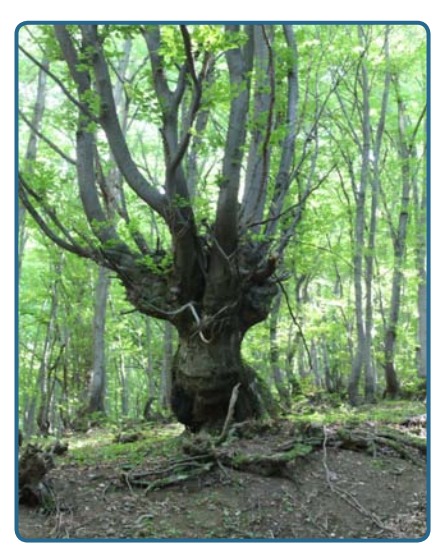
Figure 2. Coppice beech forests with pollards (near Sarajevo)