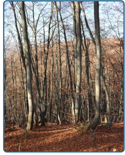
Figure 1. Productive, well developed coppice beech forest (central Bosnia)