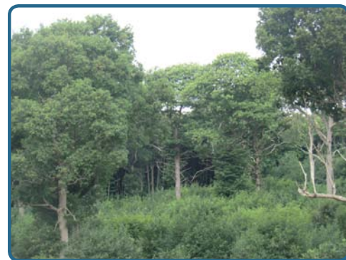
Figure 1. An example of coppice with standards in the United Kingdom

In addition to these two sectors, based on specific tree species, woods are coppiced for firewood.