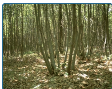
Ceduo samplce; chestnut simple coppice