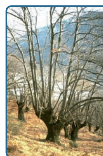
Pollarded former orchard; chestnut