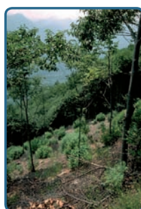
Chestnut coppice with standards