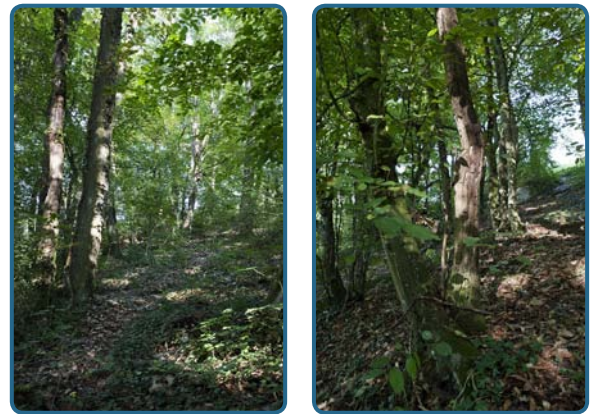
Figure 1. Aged coppice forest on steep slopes in the Untersiggenthal, canton of Aargau

context of nature conservation and the preservation of cultural historical landscapes than for economic reasons. It is possible that increasing fuel wood prices will encourage more coppicing in the future.