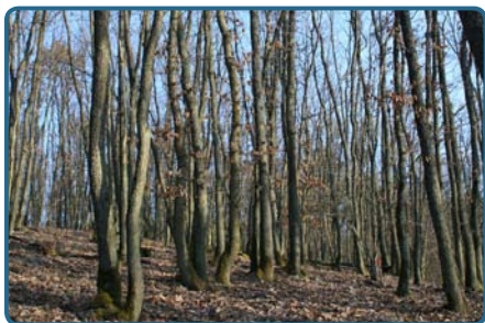
Typical German coppice forest, Baumholder, Rhineland-Palatinate