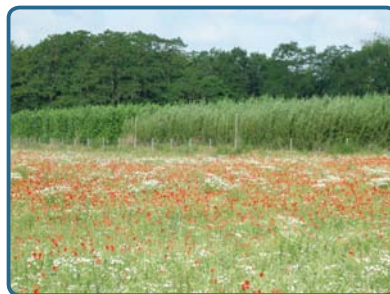
SRC Poplar and willow, second rotation period