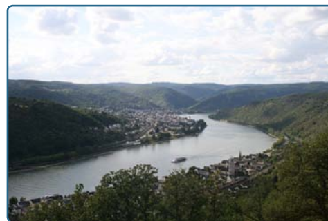
Figure 1. Overaged coppice forests still dominate the landscape along the large Rhine and Moselle waterways

Although most of these assumptions lack scientific evidence, some doubts are certainly justified. However, the fact that coppicing is the oldest type of regulated forest management can be considered as a clear indicator of its environmental sustainability. Recent research has shown that aged, overstood coppice forest can generally be managed in accordance with the pan-European criteria for sustainable forest management and that careful coppice management can preserve valuable and rare tree species such as Sorbus torminalis and Sorbus domestica . All forest managers should identify the basic situation, from stand to landscape level, at which coppicing is economically justified and needed in order to meet nature conservation objectives. It is important to conserve the remaining coppice forests and to continue their sustainable use and management.