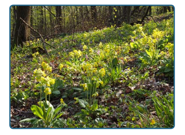
Figure 2. Coppicing in the Děvín Nature Reserve, Pálava, showed positive effects on flowering of herb species of forest understory, such as Primula veris .

The approach is similar to other studies on the legacy of past land use. Several studies have shown a marked legacy of ancient land