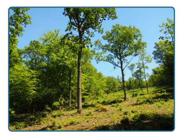
Figure 3. Coppicing restoration in the Na Voskopě Nature Reserve, Bohemian Karst. Clearings have been made to monitor the ability of coppiced individuals to resprout and the effects on biodiversity.

Summarising the published studies from sites in the Czech Republic, the main conclusion would be that the coppicing abandonment has led to a decline in biodiversity. This concerns the species-rich deciduous lowland forests, where coppicing was the dominant forest management system up to the first half of the 20<sup>th</sup> century. The decline affected both individual species requiring forest habitats with frequent canopy opening and the ecological communities where species richness decreased and homogenization of species assemblages was documented. Remaining knowledge gaps concern the effects of coppicing abandonment on other groups