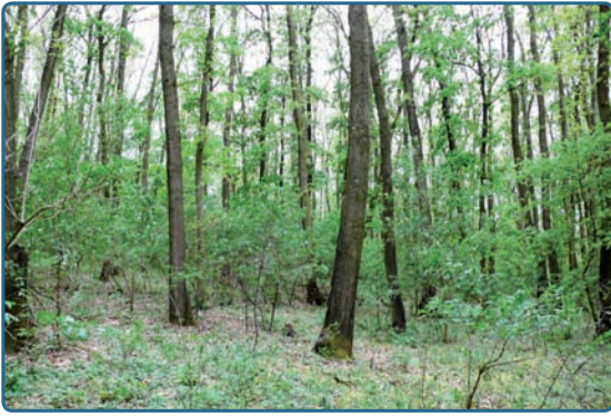
Figure 5. Mixed aged oak-horbeam coppice forest invaded by R. pseudoacacia , Slovakia

Rhamno-Prunetea class we can distinguish three alliances with R. pseudoacacia :