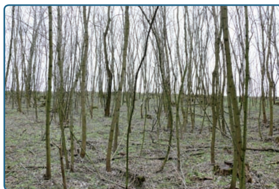
Figure 3. Robinia pseudoacacia coppice stand, Slovakia

Seeds remain on the tree for a long time (even until the following year) and a single individual can produce 15.000-17.000 seeds per year. Seed production increases exponentially with age; a 50-year-old stand can produce 1 billion seeds ha -1 year -1 . The seeds are dispersed by wind and endozoochory. Germination is limited by a hard epispem, so that only a portion of the current year's seed may germinate annually; seeds in the soil seed bank can remain viable for over 40 years (Bartha et al. 2008). Abiotic factors, such as low temperature, can damage the seed perispem and may limit seed germination. Young seedlings can grow up to 1 m tall in the first year; flowering occurs after five years. Vegetative propagation is sometimes dominant, arising either from the stem or root suckers. Its "rope-like roots" can be as long as 20 m. Due to this excellent vegetative propensity, coppicing is the most common form of management (Fig. 3 & 4).