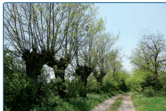
Figure 6. Pollarded Robinia pseudoacacia trees along a lane, Slovakia

ploughing, or semi-natural reforestation with root suckers and man-made reforestation using deep loosening or complete soil preparation (Frank et al. 2017). Rarely, the trees are also pollarded (e.g. Slovakia, Fig. 6). In Hungary, the tree is often defined as a national treasure or cultural heritage (“Hungaricum”) and the majority of foresters and the local population disagree with the dominant European perception of an “invasive plant to be removed”. The Hungarian understanding of the species is exemplified by the following statement: “The economic viability of biomass production by black locust has been debated many times ... but established in a multi-purpose, ecocycle-based agricultural system where its invasive character is carefully controlled and its usefulness is fully utilised (applying even clone selection for site-adaptation and best possible performance), both environmental sustainability and profitability should be guaranteed.” (Némethy et al. 2017). In other Central and Eastern European countries (Slovakia, Romania etc.) new plantations are rarely established, but old plantations are maintained. A very productive variety with distinct features was described in Southern Romania. The profitability of black locust as short rotation coppice can be questionable (Stolarski et al. 2017) but it can be ecologically and environmentally attractive in previous mining and agricultural areas (Carl et al. 2017).