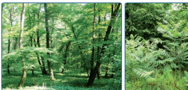
Figure 1. Canopied, uncut coppice forest (left), and A. altissima growing in a clearing (right), Bábsky Les, Slovakia

It has a large ring-porous wood structure with which water is rapidly transferred from its roots to its leaves and, conversely, it can reduce transpiration on hot days by summer branch drop (Kowarik 1983, Harris 1983, Lepart et al. 1991). It effectively reduces water loss by stomatal closure and lowered root hydraulic conductance (Trifilo et al. 2004). Two-year-old seedlings develop coarse, lateral, unbranched and widely spreading roots up to 2 m long. A. altissima is classified as a shade-intolerant, early successional species (Knapp and Canham, 2000). Delayed hard frosts may cause injury to young plants and to the upper shoots of older plants; however, it can survive temperatures as low as -35 °C. The tree has allelopathic properties in bark extracts, leaves, and seeds etc. due to flavonoid substances such as acacetin, apagenin etc. (Udvardy 2008). The direct influence of secondary metabolites of Ailanthus on biodiversity in natural ecosystems has been questioned by Mihoc et al. (2015).