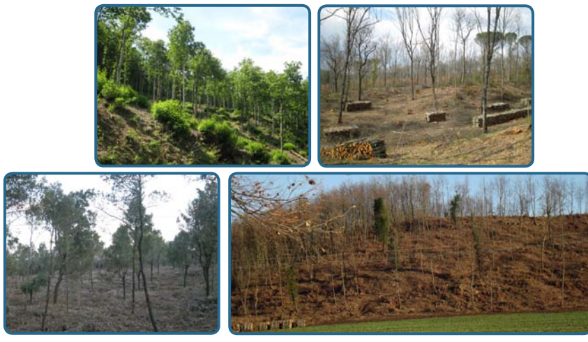
Coppice with standards: chestnut (upper left), downy oak (upper right), holm oak (lower left), turkey oak (lower right)