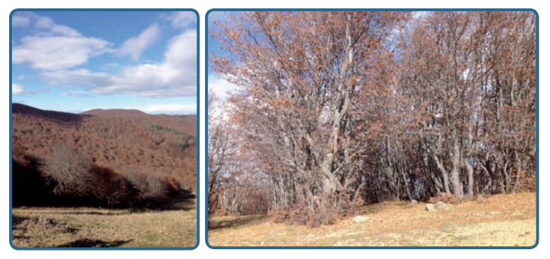
Figure 1. Over-aged beech coppice in Pollino national Park, Southern Italy

In a similar way, the conversion from coppice to high forest is not always feasible, but rather contingent on species composition and site fertility, and might pose future regeneration problems. It may also cause biotic homogenization at the stand level (Van Calster et al.