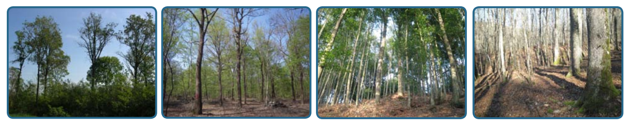
Mixed management systems